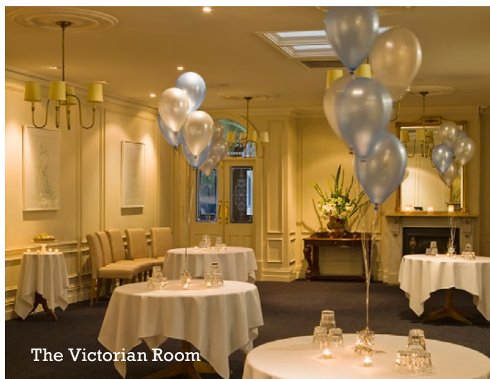
The Victorian Room