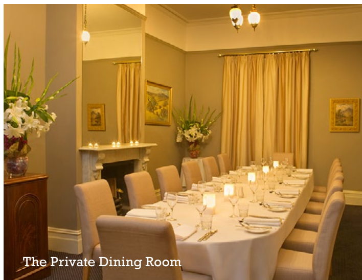
The Private Dining Room